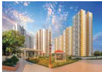
Elita Garden Vista | New Town, Kolkata