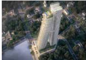
Altair | Colombo, Sri Lanka