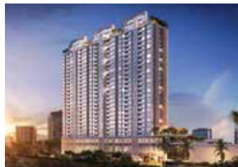
Ventana | Pune