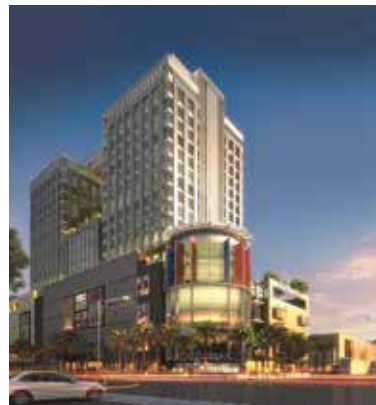
Acropolis Mall | Kolkata