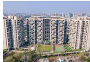
The One | Tollygunge, Kolkata