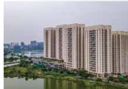
Fifth Avenue | Sector-V, Salt Lake