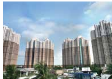
South City Residence | Kolkata