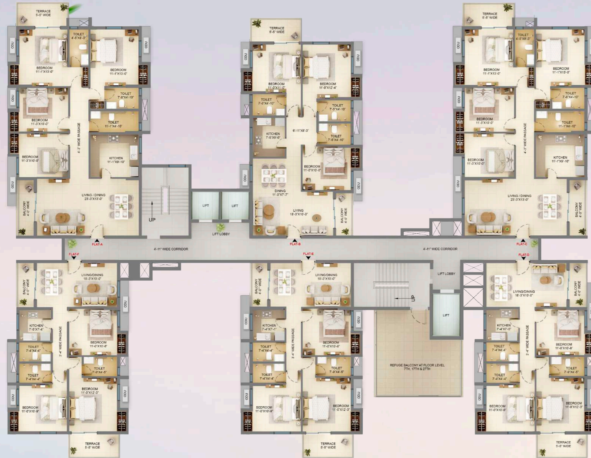
TOWER-2: 4th, 6th, 8th, 10th (Altr.)