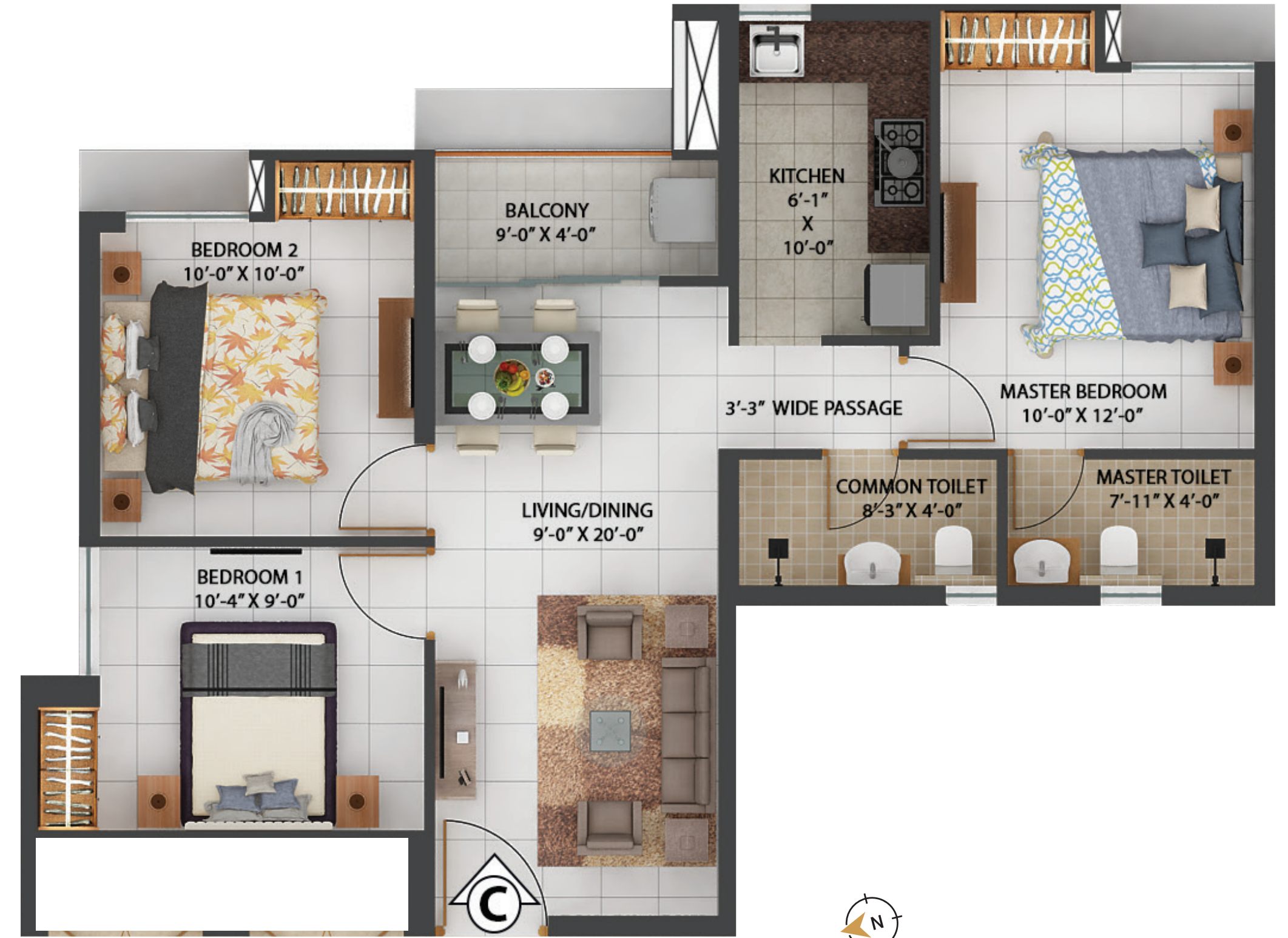
BLOCK B6 (2B+G+27) | Flat Type - C (3BHK + 2T)