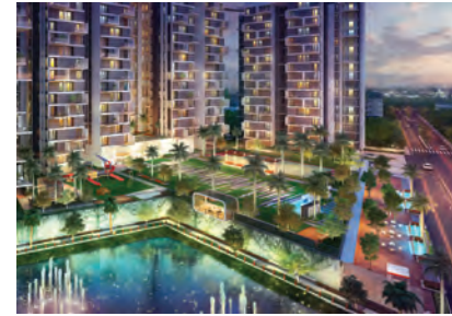
The One | Tollygunje, Kolkata