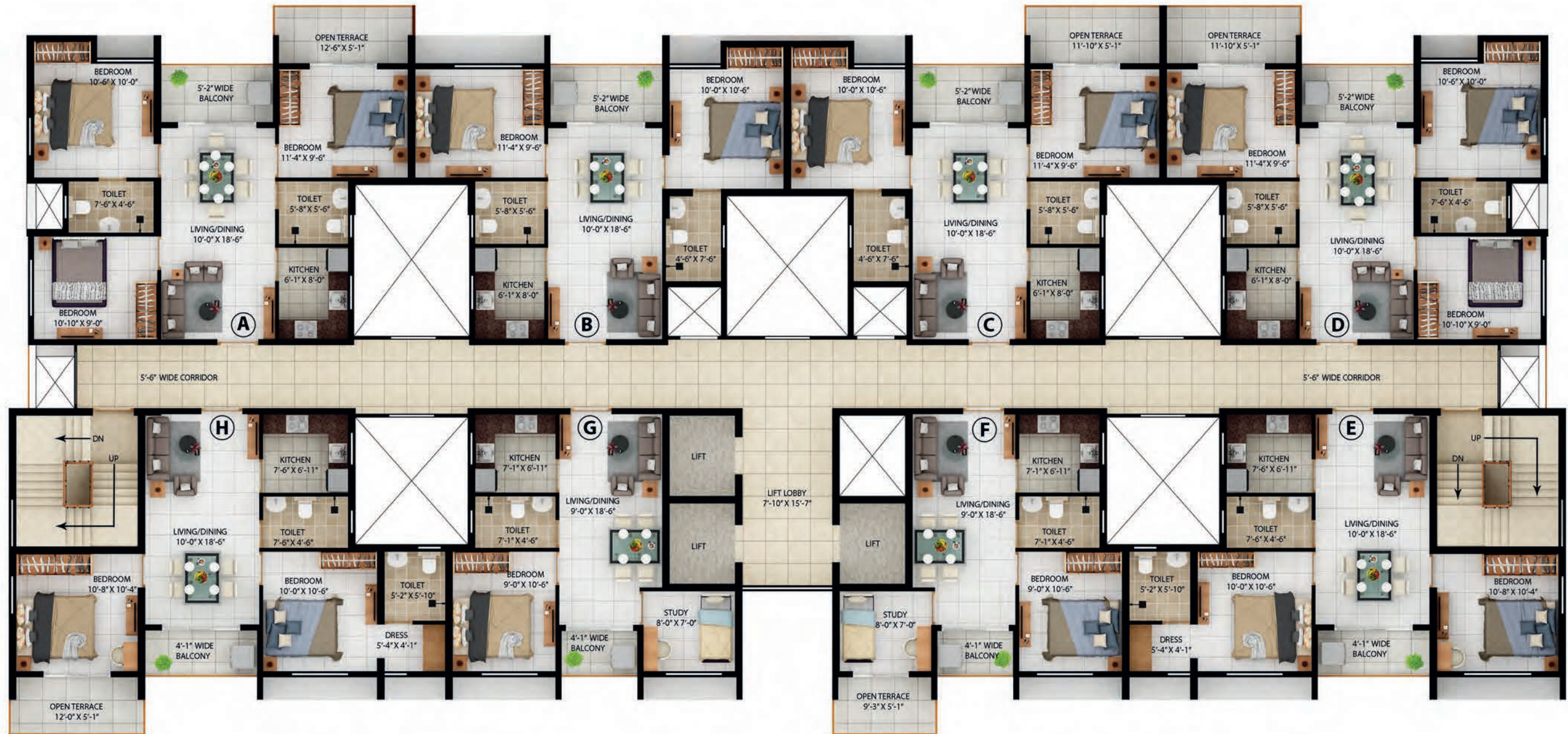
RIA (BLOCK 3B) | Typical floor plan (2nd, 5th, 8th & 11th Floor Plan)