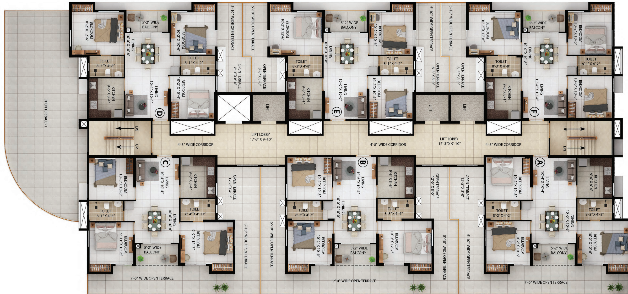
REVO (Block 1) | 1st Floor Plan